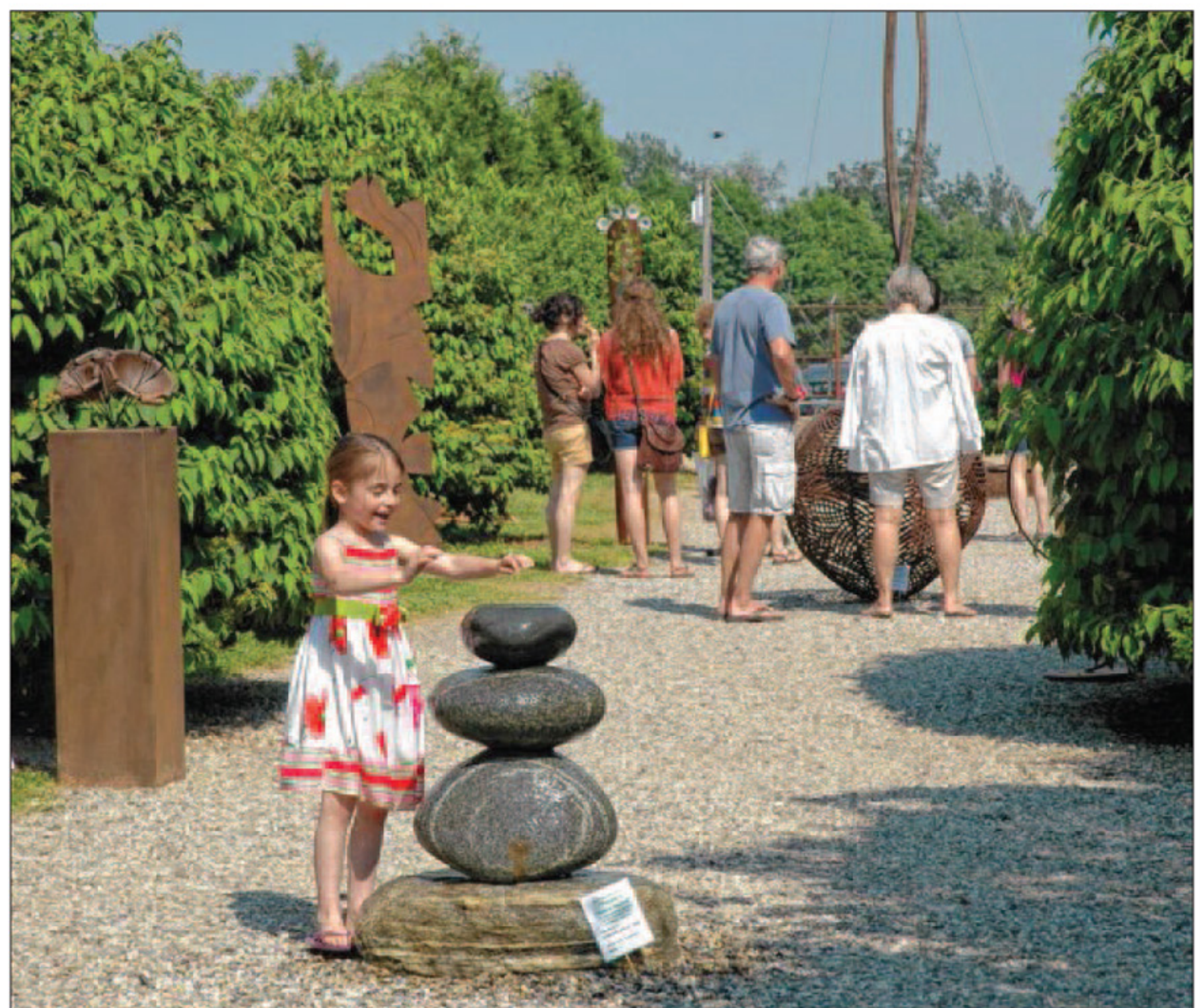
The outdoor Sculpture Garden is permanently landscaped at the Three County Fairgrounds. Each season brings a new set of artist installations, including sculpture, fountains, birdbaths and furniture.